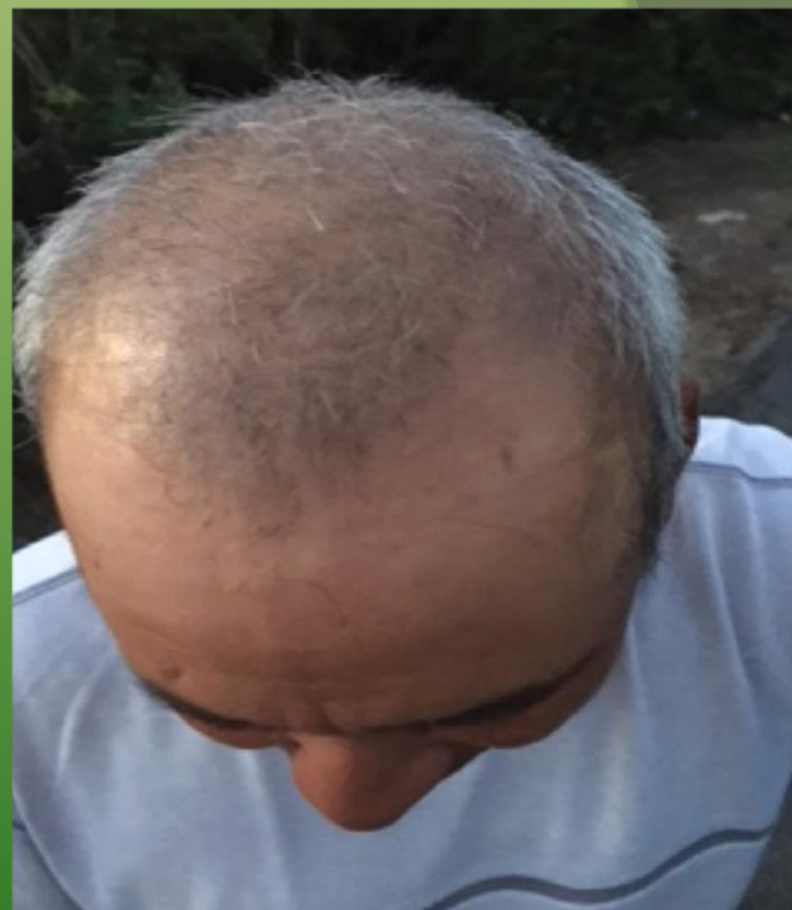
Day 180, [6months] once daily application