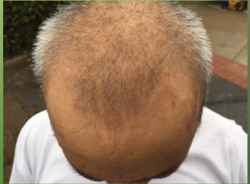
Day 90, [3months] once daily application