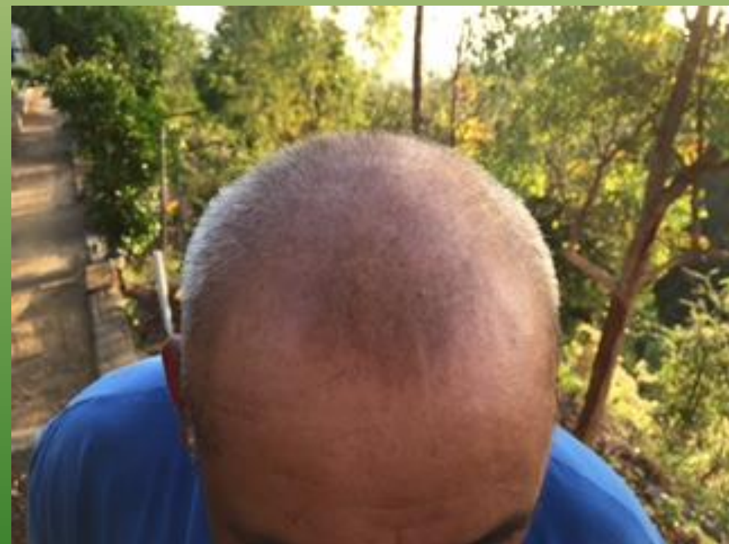
Day 0, prior to utilizing FolliStem