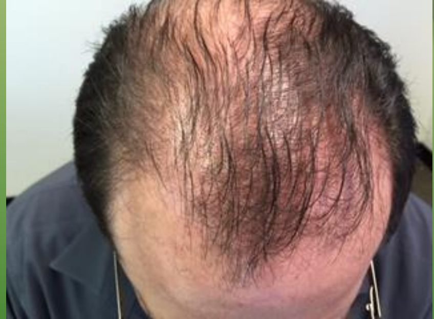
Day 180, [6months] once daily application