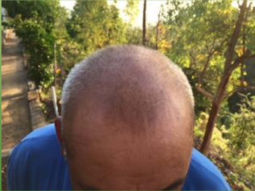
Day 0, prior to utilizing FolliStem