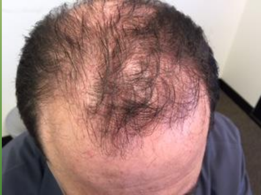
Day 0, prior to utilizing FolliStem