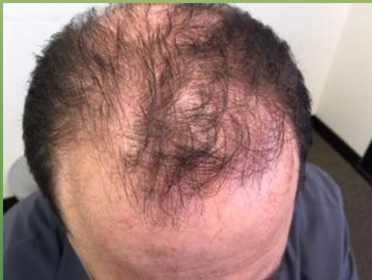
Day 0, prior to utilizing FolliStem