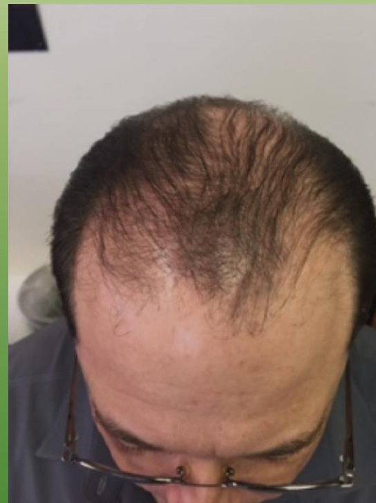
Day 90, [3months] once daily application